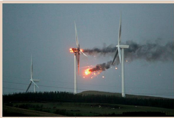
Fire: The wind turbine in North Ayrshire went up in flames on Thursday.

Ice, debris, or anything breaking off the wind turbine blades, including the blades themselves, can impact a point 1700' from the turbine base.